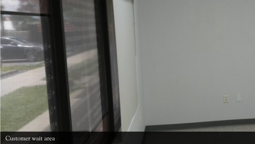
Customer wait area