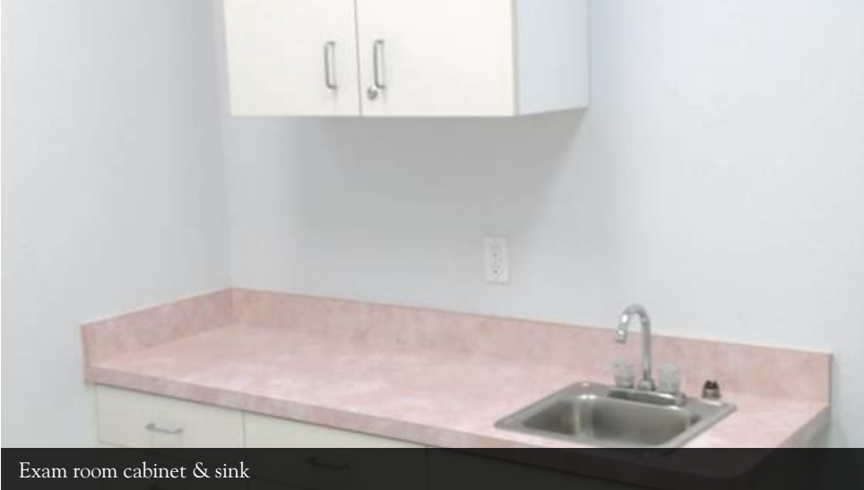
Exam room cabinet & sink