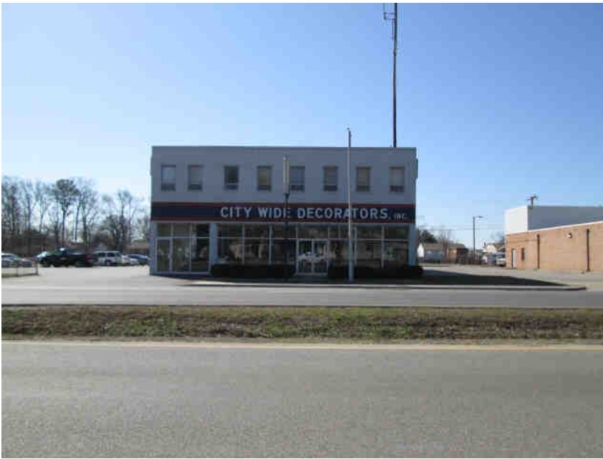
Last Photo Update 03/17/2014