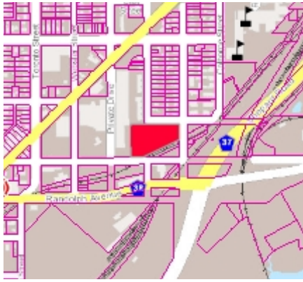
Parcel location within Ramsey County