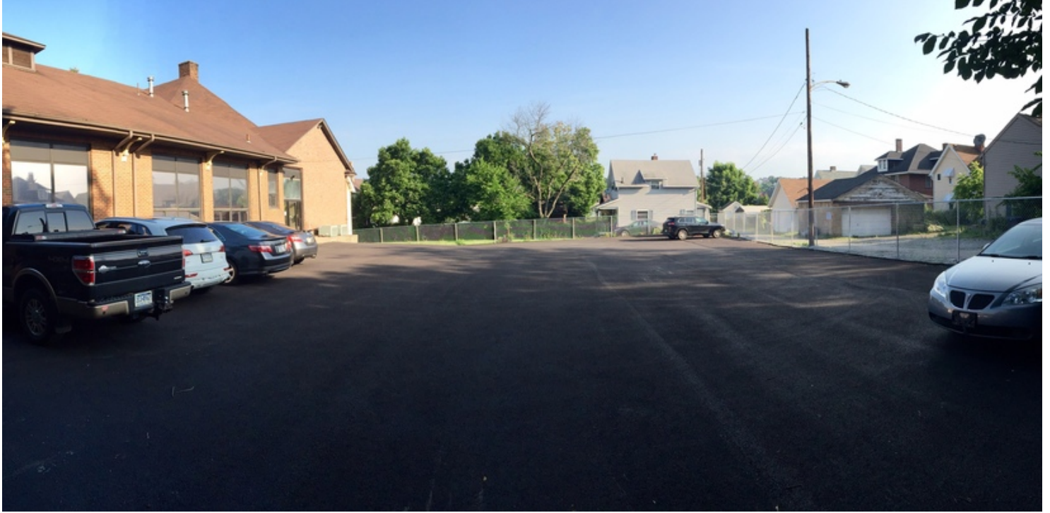
311 South Central Avenue